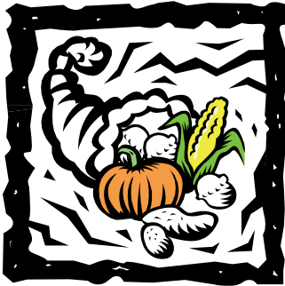
Thanksgiving Food Drive for St. Vincent de Paul Society