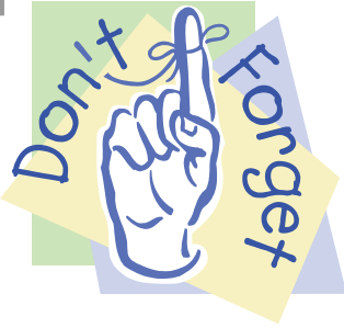
Mark your calendar NOW for important PSR dates & times